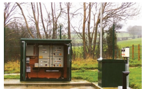
Sewage pump station